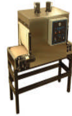
Our CoreWrap® Process